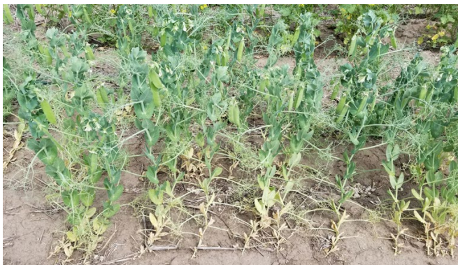
Stunting and yellowing and low yield under high disease pressure.