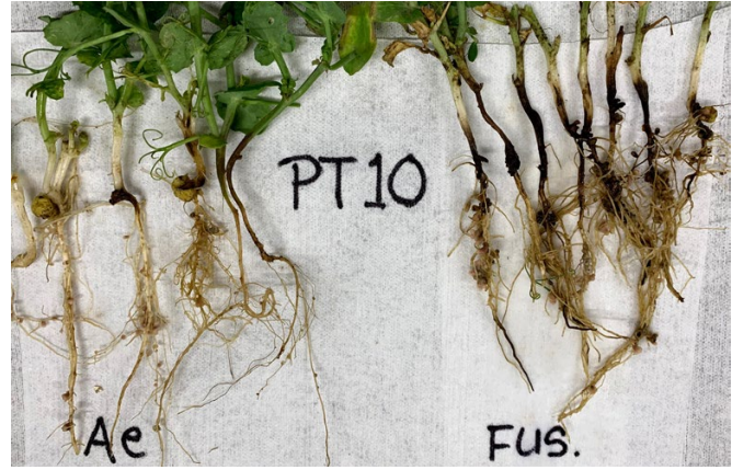
A pea line that shows some partial resistance to Aphanomyces euteiches (left) but not to Fusarium avenaceum (Fus).

Another major finding confirms that extended rotations from pea are necessary to reduce root rot effects.