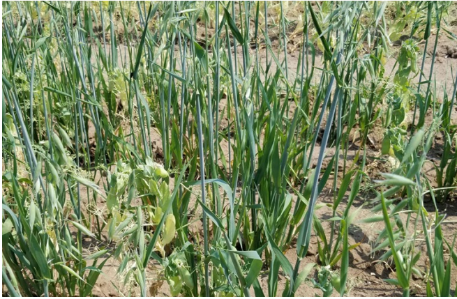
Pea/oat intercrop did not favour pea under drought conditions.