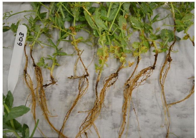
Plants from field, showing Aphanomyces , honey-brown root discoloration, loss of lateral roots, and pinching/browning of epicotyl.