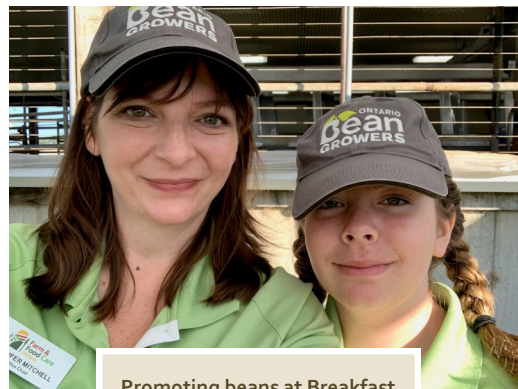
Promoting beans at Breakfast on the Farm in Napanee.